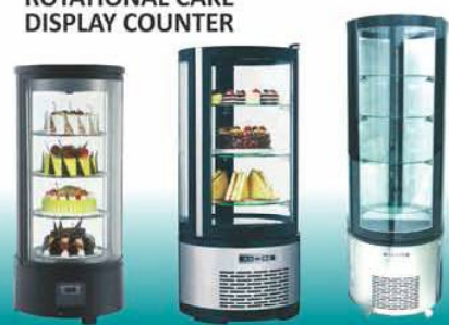
FRTC-72L FARC-150R FARC-400R