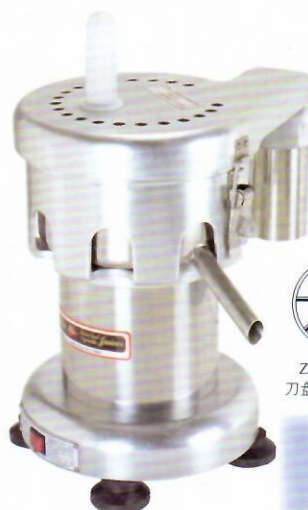
ZJ-1 ZJ-1A 外壳喷漆/外壳抛光 Painted body/Polished body