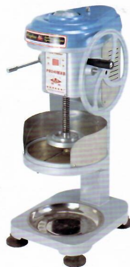
PB240 刨冰机 Ice Flaker

电机功率Power: 180 W 额定电压Voltage: 220 V 生产能力Productivity: 120kg/h 外形尺寸Size: 422x402x745mm