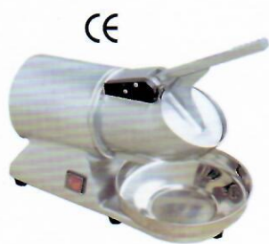
SB3 碎冰机 Ice Chopper

电机功率Power: 180 W 额定电压Voltage: 220 V 生产能力Productivity: 1.6kg/min 外形尺寸Size: 430x160x260mm