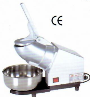
SB6 碎冰机 Ice Chopper

电机功率Power: 180 W 额定电压Voltage: 220 V 生产能力Productivity: 1.6kg/min 外形尺寸Size: 430x160x260mm