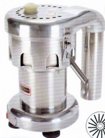
ZJ-145 外壳抛光 Polished body