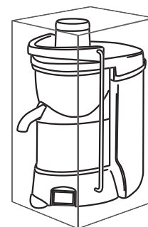
SHIPPING BOX W : 300 mm / 12" D : 510 mm / 21" H : 500 mm / 20"