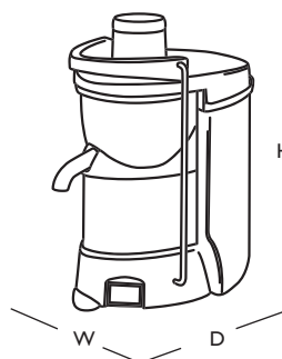
APPLIANCE W : 260 mm / 10" D : 470 mm / 19" H : 450 mm / 18"

Net : 16 Kg. (35 lbs) Shipping : 17 Kg. (38 lbs)