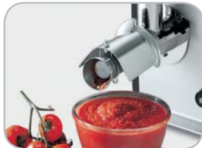
TC 12 DENVER Passapomodoro opzionale Optional tomato sauce making