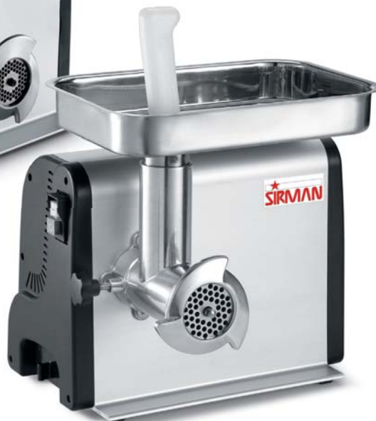
TC 12 DENVER