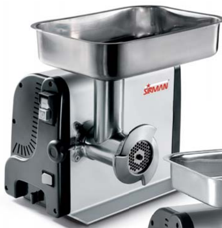
TC 8 VEGAS