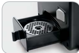
Cassetto porta coltello e piastra Compartment for knife and blade